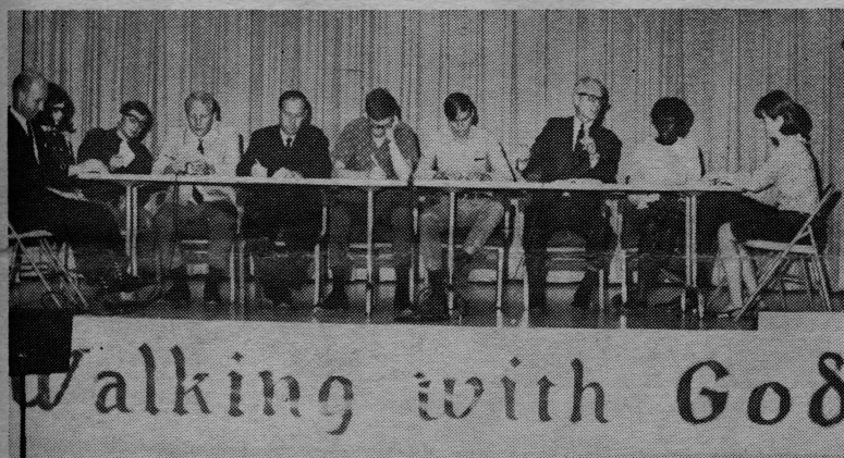
A student and faculty panel anticipates the next question to be brought up for discussion.

Hurray! We're off! Those were the joyful words of all the PVA students on Friday, September 15, around two-thirty.