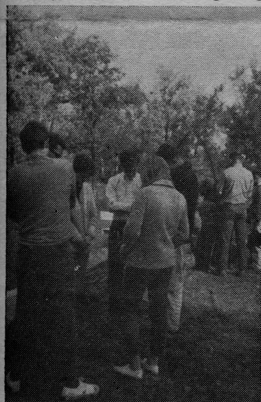
PVA campers begin the day with early morning Power Hour.

Subscription price $1.00 per year. Second class mailing postage paid for at Shelton, Nebraska 68876.